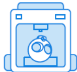
3D Design + Printing