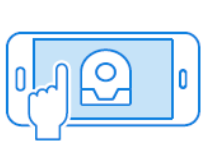
Mobile Play + Programming

This guide provides important information for getting started with your robot.